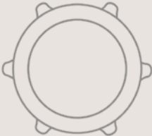
Conex Compression ribnut profile